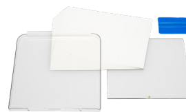
Advanced 3D printing kit Add a front enclosure, extra build plate and adhesion sheets